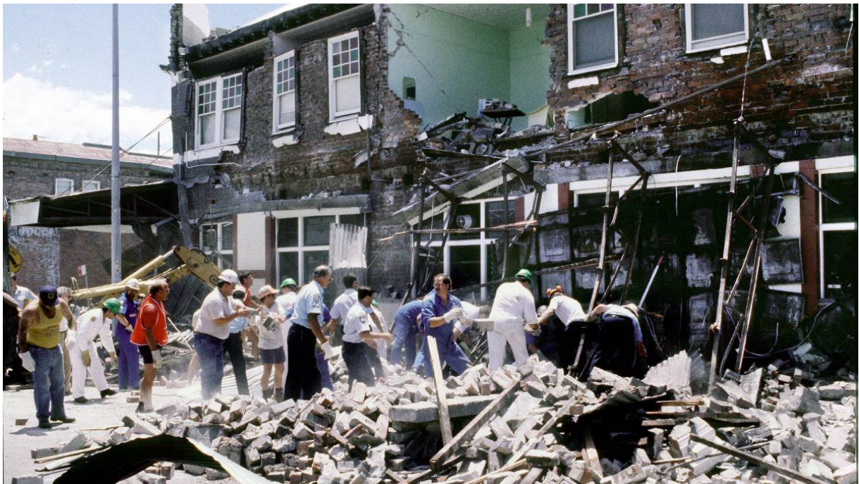
Rescue crews working to find people trapped under rubble beneath the Kent Hotel awning in Hamilton