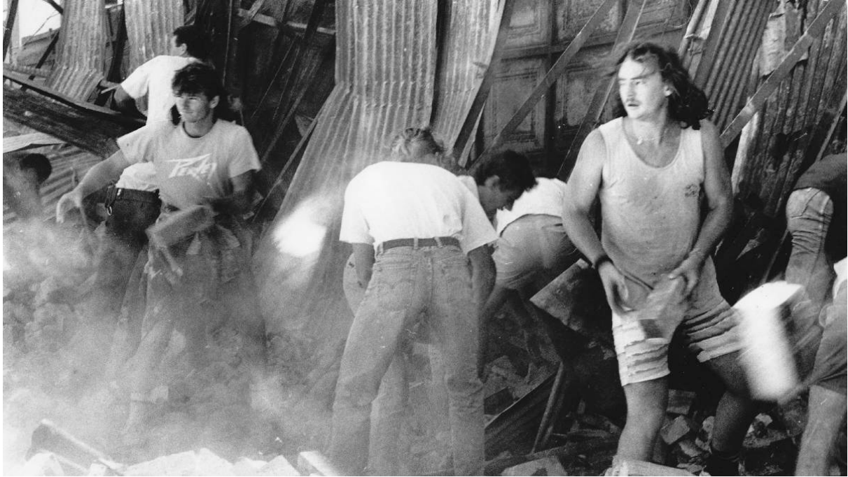
Hamilton community rallies to help victims of earthquake and to clear debris in search of more trapped persons