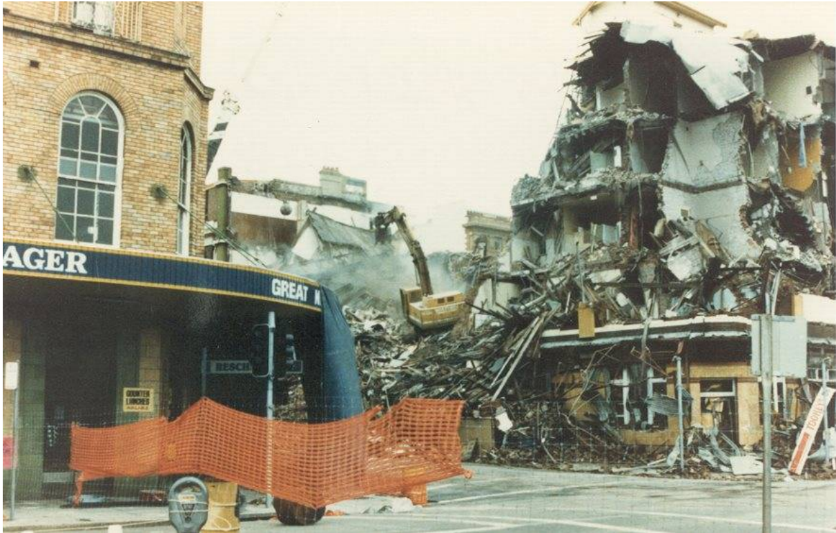
George Hotel in Newcastle just after the earthquake on the day of its demolition as a result of earthquake damage