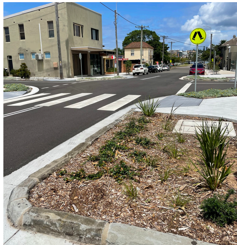
The historic sandstone gutters along the kerb were removed for cleaning and have now been returned to frame key intersections and raingardens.

We are also making good progress with our upgrade of Mitchell Street, Stockton, with works scheduled to finish in mid-2022.