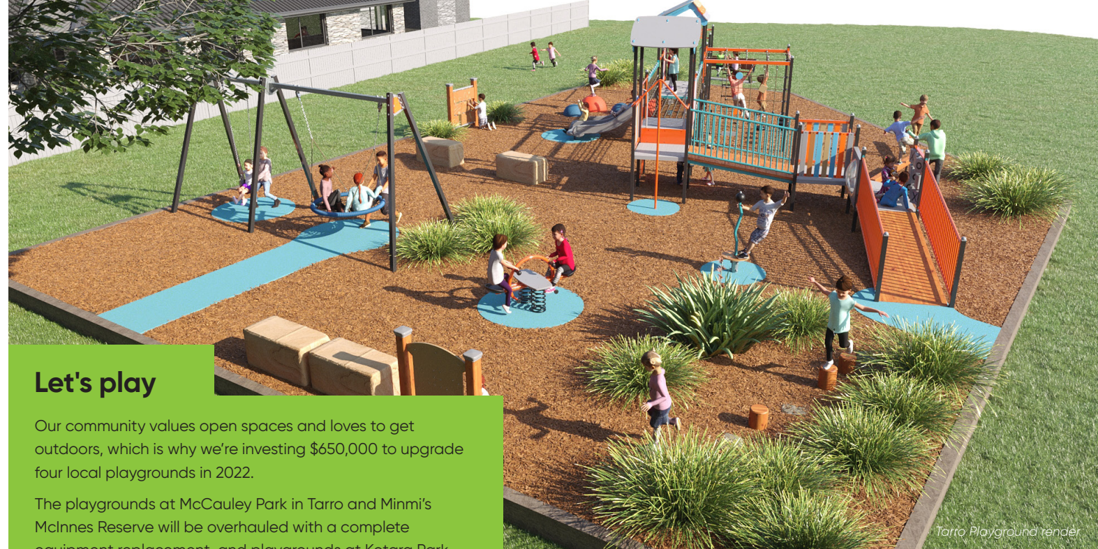
Tarro Playground render