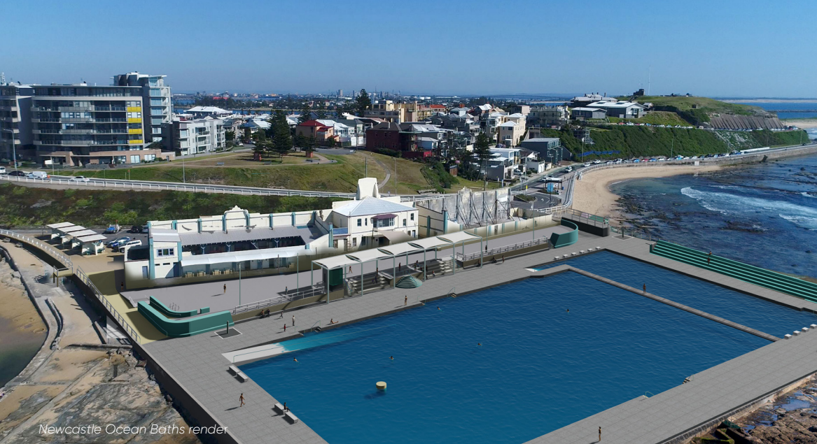
Newcastle Ocean Baths render