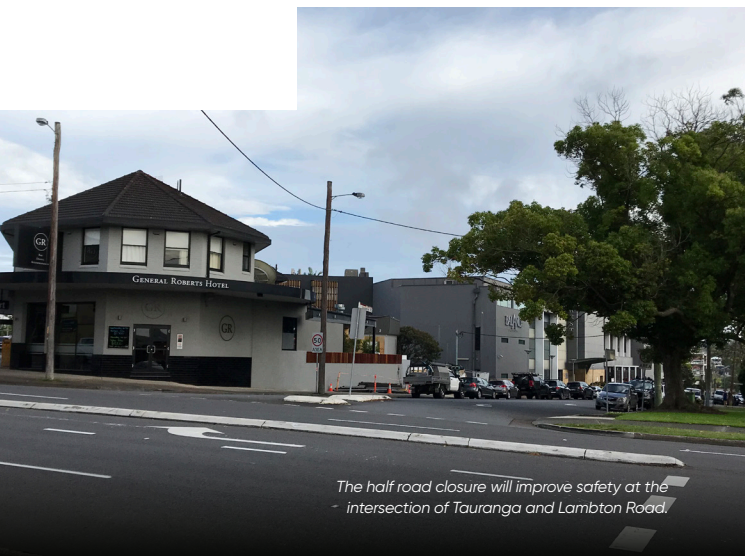
The half road closure will improve safety at the intersection of Tauranga and Lambton Road.