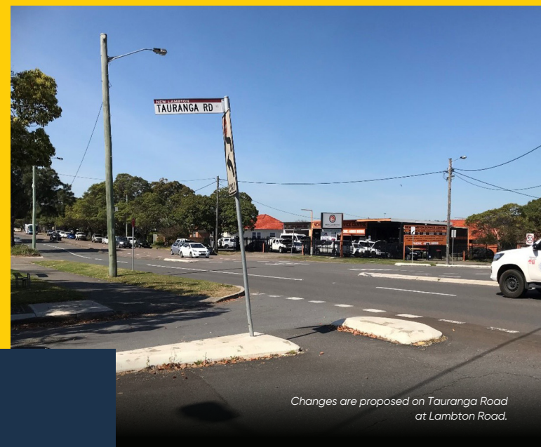
Changes are proposed on Tauranga Road at Lambton Road.

The public exhibition period will close at 5pm on Monday 17 January 2022.