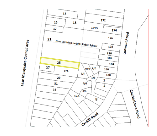
Subject Land: 25 Marshall Street New Lambton Heights

A copy of the amended plans for the proposed development is included at Attachment A .