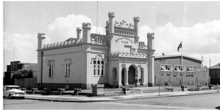
RSL & Council Chambers. Stockton Historical Society

Stockton became a municipality in 1889 and three years later council chambers were built. The building had distinctive turrets and battlements with English-style leadlight windows. When eleven suburban councils amalgamated in 1938 to form Newcastle Council, the building was no longer required. Stockton RSL Club took over the site, demolished the former council chambers in 1967 and had new premises constructed for the club.