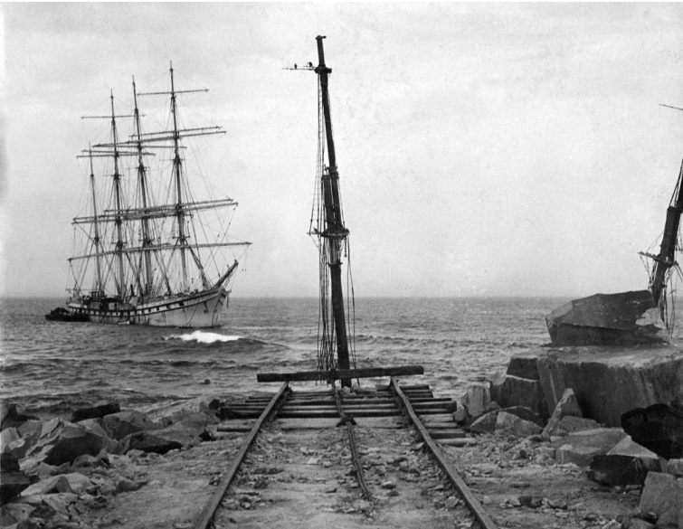
Wreck of the Adolphe beyond the end of Stockton breakwater. In foreground are masts of Regent Murray which sank in 1899.

Construction commenced in 1898 on a northern breakwater, which we know today as Shipwreck Walk. It was built of stone from the Waratah quarry near Braye Park and a railway system hauled the stone down King Street. The breakwater was extended to the wreck of the Adolphe after it was pushed by heavy seas onto the wrecks of the Colonist , Wendouree and Cawarra in 1904. Part of its hulk can be seen today and underneath the walk are the remains of other iron and steel wrecks.