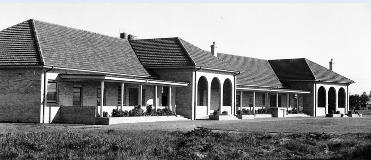
Stockton Hospital, 1944.

Originally designated as a quarantine hospital in 1893, the facility did not open as a quarantine centre until 1900. An outbreak of bubonic plague in that year forced authorities to construct buildings and open the facility. Prior to this, sailors from disease-stricken boats were transported to the Sydney Quarantine Station. In 1911 the complex was converted to a mental health facility named Stockton Hospital. A further name change occurred in 1917 when it became the Stockton Mental Hospital. It closed in 1989 and became the Stockton Centre. The government closed this facility in 2020 and plans have yet to be released regarding future use of the site.