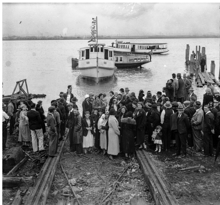
Launch of Newcastle harbour ferry Darra at Stockton C1934.