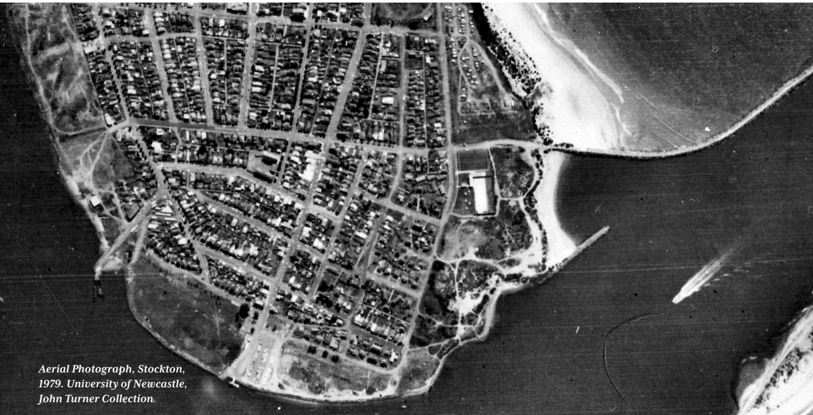
Aerial Photograph, Stockton, 1979.

We acknowledge the Worimi people, the Traditional Custodians of the land and waters which are featured in this guide. We recognise their cultural heritage, beliefs and continuing connection to the land and waters, and pay our respects to Elders, past, present and emerging.