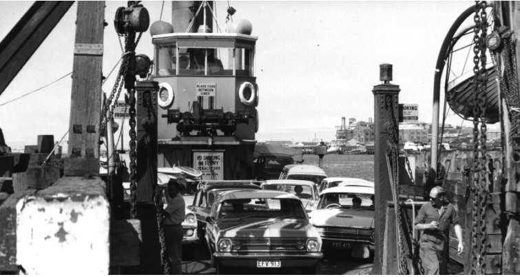
Leurgurena, Newcastle 1970

Operated from 1916 to 1973 when the Stockton bridge was opened. The punt, Mildred , was the first to operate the service between Newcastle and Stockton and was capable of carrying 16 cars. Larger ferries, the Leurgurena (purchased in 1945) and the Koondooloo , (entered service in 1952) took over the route until the bridge opened. Both ferries then headed to the Philippines but broke from their moorings and were wrecked off South West Rocks in 1972.