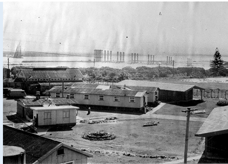
Fort Wallace. Stockton Historical Society