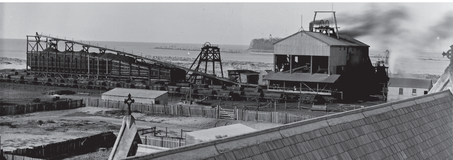
Stockton Colliery, Stockton 1897.

St Peter's Church opened in 1887 and on weekdays was used as a school. Two years later, a convent to house the Sisters of St Joseph, was built adjoining the church. The first purpose-built, school structure was opened in 1903 and the Sisters of Mercy ran the school until 1985. Today the school operates under the control of the Newcastle Catholic Schools Office.