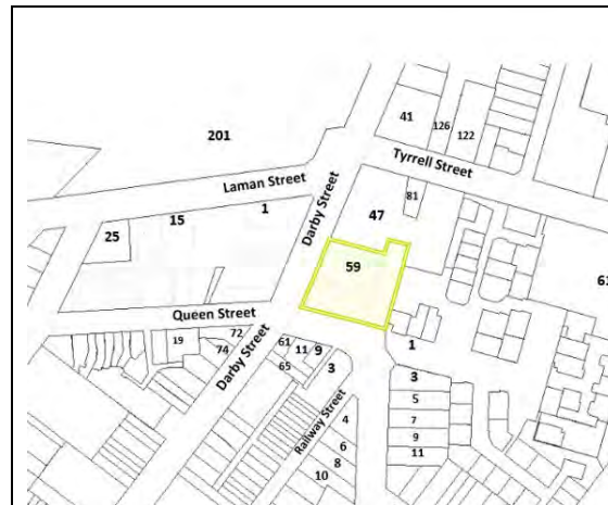
Subject Land: 59 Darby Street Cooks Hill

The proposed development was publicly notified in accordance with City of Newcastle's (CN) public participation policy and 27 submissions have been received in response.