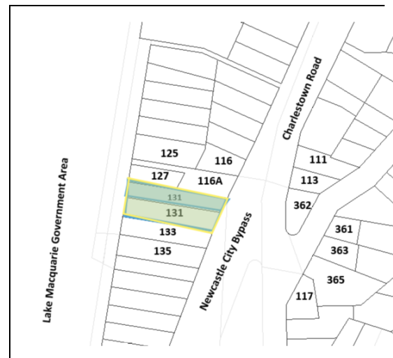
Subject Land: 131 Marshall Street Kotara

The application is referred to the Development Applications Committee for determination, due to the number of objections received.