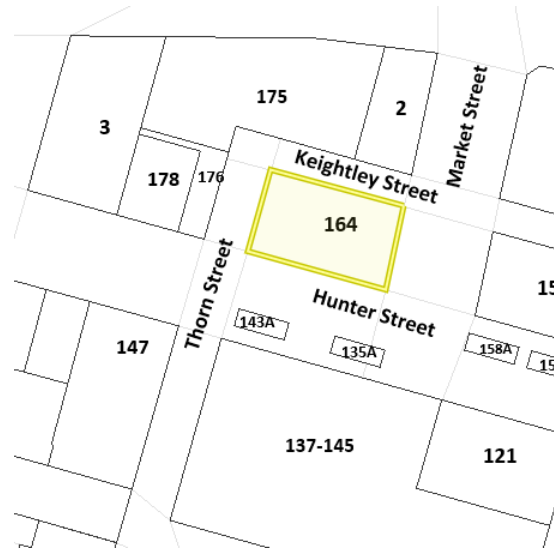
Subject Land: 164 Hunter Street Newcastle